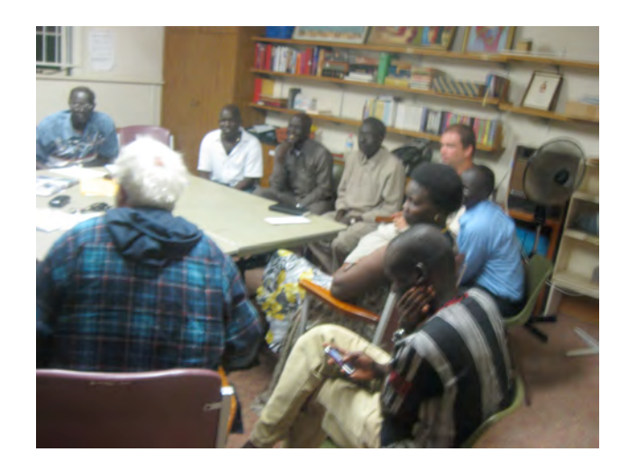
- Sunday School 2003